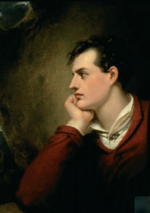
Lord Byron by Richard Westall oil on canvas, 1813

Just like Byron's poem itself, the musical interpretation of Don Juan is full of wit, charm, elegance, adventure and horror, revealing a deep portrait of one of the greatest creative minds of the Romantic era.