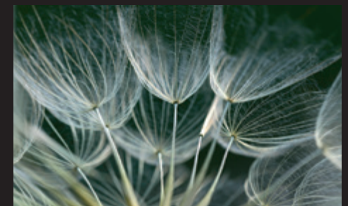
Parachutes from Nature: the Dandelion (left) and the Goat's Beard seed head (right). Amongst a plethora of other achievements, Leonardo da Vinci invented the parachute.