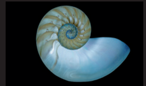
Nautilus Shell – Mathematical Beauty