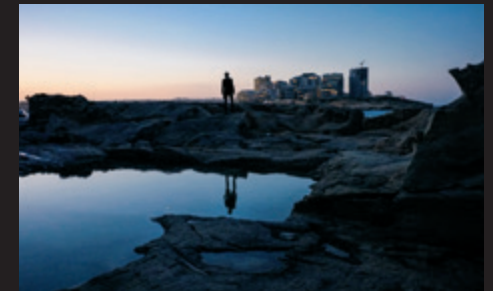
New Age

The myriad of themes that emanate from the 500th anniversary of Leonardo da Vinci's death provide the richest, broadest and most visual storyboard for this year's exhibition on the theme of "Music and Invention". And there can be fewer more inspirational lives. Regarded by many historians as the 'universal genius' or 'Renaissance Man', he was a man of "unquenchable curiosity" and "feverishly inventive imagination". His contributions can be seen in so many key walks of life, in fields of painting, sculpture, science, music, mathematics, architecture, engineering and astronomy and the exhibition interprets many of these fields of invention with stunning photographs.